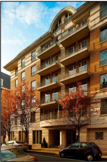
Marriott Executive Apartments Brussels

Hotel Sofitel Brussels Europe: Pl. Jourdan 1, 1040 Bruxelles, Belgium, (+32) 2 235 51 00