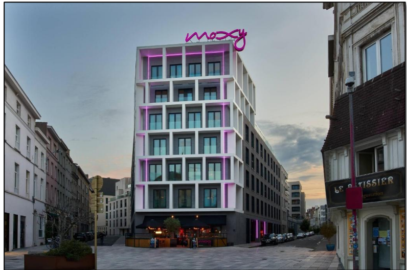
Moxy Brussels City Center