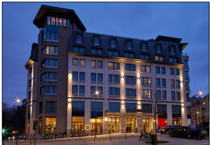
Hotel Sofitel Brussels Europe